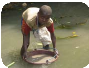
A young boy in Mboh Nso, Cameroon, collects water from the river.

The following statement from a man named Denis in Nkuv, Cameroon, who acquired a biosand filter last year sums up the powerful connection between safe water and health: