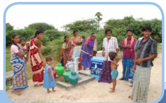
Enthalpatty Village well dedication